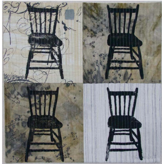
The Gift, made for the Spotlight Auction